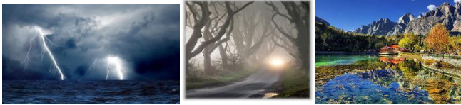
Open the door maybe you'll see...

Write a poem about the picture below e.g. describe clouds, sea, lightening. Use personification, metaphors and similes to help describe. Remember to use SPACED openers.